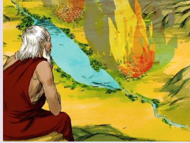
Abraham watches Sodom and Gomorrah burn up

Our next example is the number 19 FAITH.