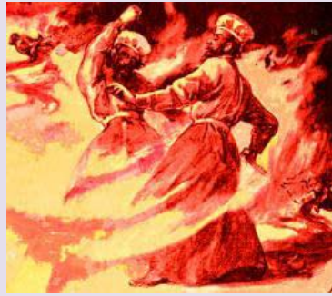
Death of Nadab and Abihu

Our next example is the number 100 HOLY FLOCK.