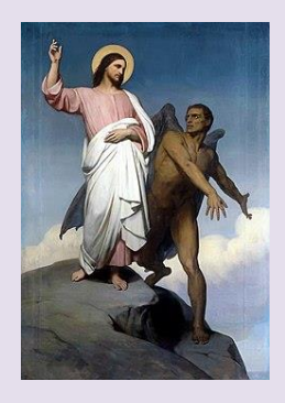
"Have you seen my servant Job?"