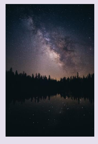
'We look through a glass darkly'