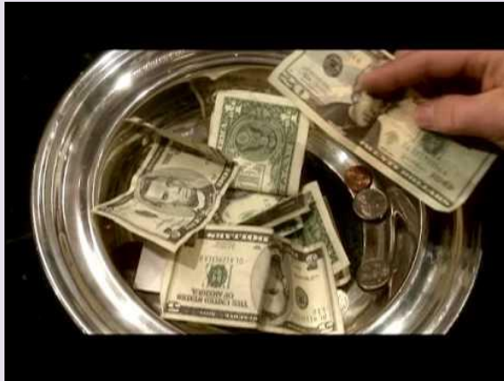
Worker's wages {but no reward in heaven}

But the LORD will preserve a circle of those who serve him in meekness and humility: