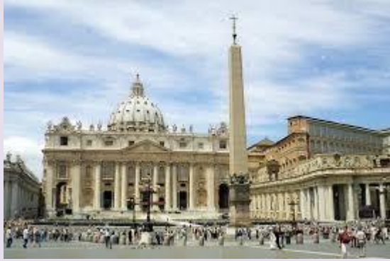
Saint Peter's Basilica

Asherah Poles arise at the heart of Man's Religion: