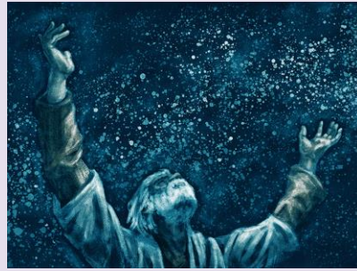
Abraham Believes (Gen. 15 v 5-6)