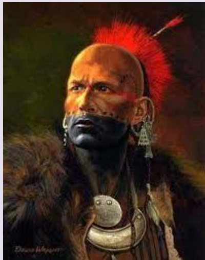
Amorite Warrior (Iroquois Nation)

The Amorites occupied the East bank of the Jordan from Mount Hermon to the border with Gad plus the wilderness of Judah. The Amorites were tall, swift, skilled and brave warriors. The Amorites are prophetic of all the animistic warlike tribes who were the original occupants of the British Isles, Americas, and Africa when explorers first reached them.