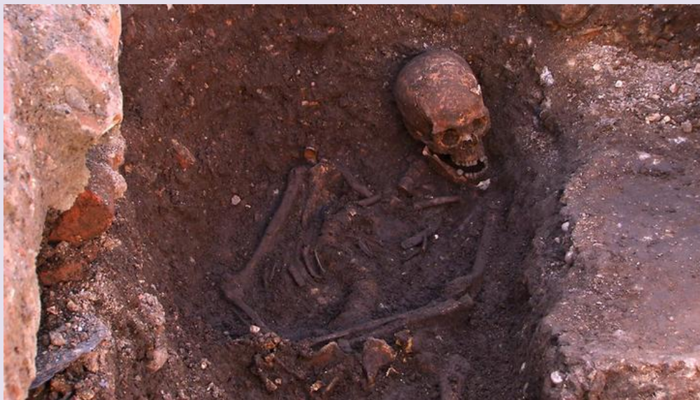
King Richard III – remains found under a parking lot – no power to save his own life