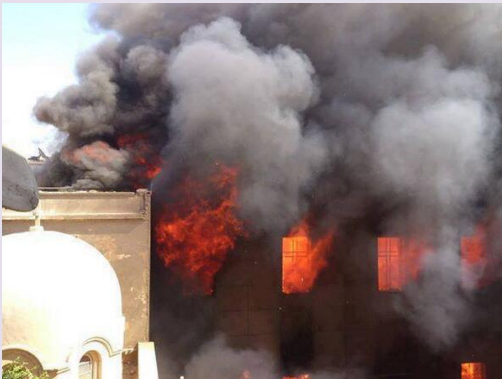
23 Sept 2014 - ISIS burns Armenian church (a 'city' of another feudal religion – sect, faction)