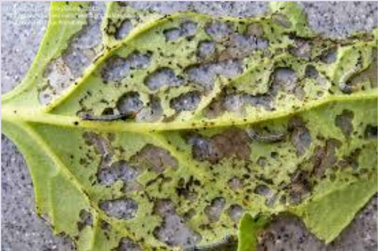
Worms devour the garden of Great Britain's soul