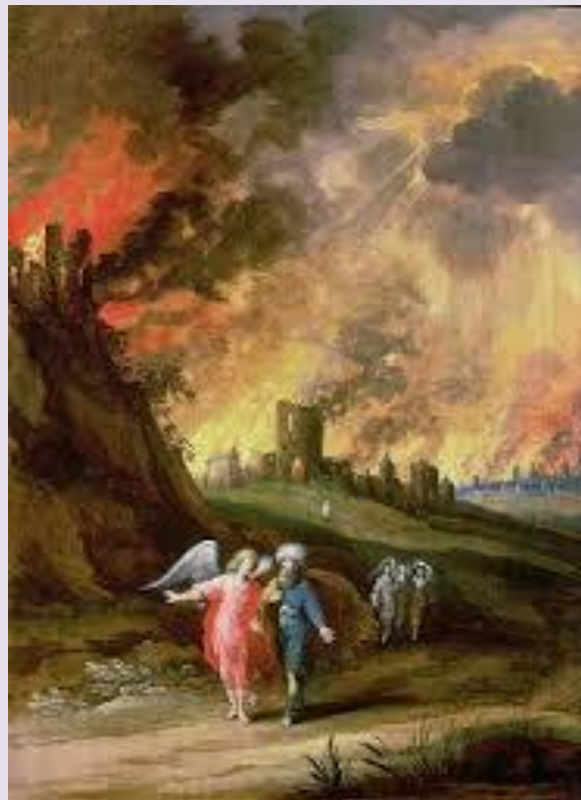
Believers warned of destruction flee Sodom and Gomorrah (Depart the Faith!)