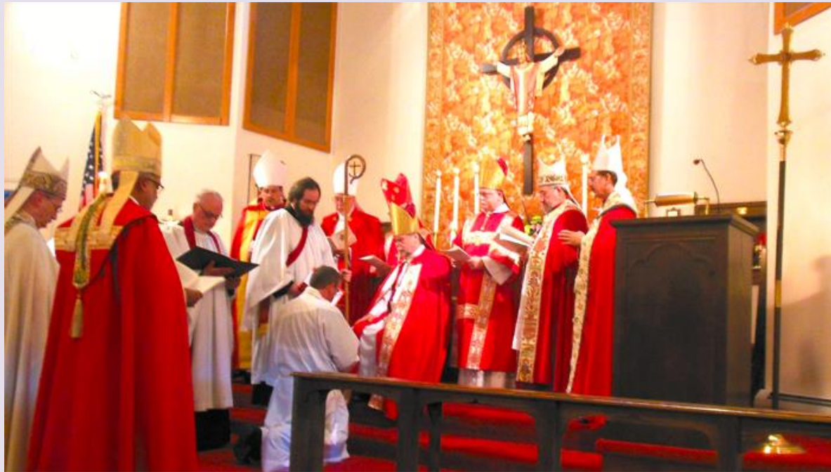
Clergyman of Anglican Church consecrated with the august title: "The Very Reverend Bishop Suffragan"