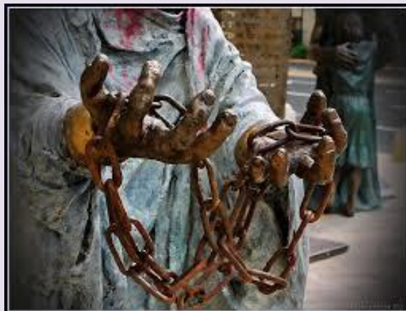
Blinded King Zedekiah in chains