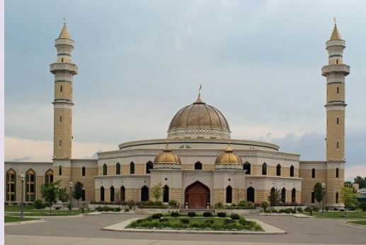
Mosque in the U.S. 7

The first sign: Ishmael [ Islam ] will get a wife [ community of believers ] in Egypt [ America ]. This sign was fulfilled in 1915 when the first mosque was established in America 8 . Today, in 2015 , a hundred years later there are an estimated 2 million Muslims in the United States . It not a coincidence that in April 25, 1915 the Allies invaded Turkey and on April 26, 1915 250 Armenian Christian intellectuals were killed in Istanbul . Within 6 months the deportation of millions of Armenians began leading to death by exposure to cold for half of them. The defeat of the Ottoman Empire in WWI led to the UK appropriating Palestine, which made the Balfour Declaration possible. The cost of a homeland for the Jews? 1 million Armenian Christian lives and a homeland for Moslems in America . This price the Americans will live to regret one day.