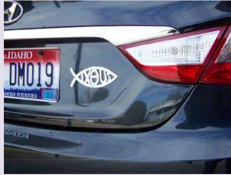
'I am Rich!'

The third sign: The Seventh Ewe Lamb , the seventh church of Revelations, forsakes her duty to follow Jesus and in His place embraces worldliness: