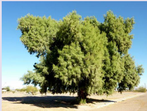
Tamarisk tree (note star of David!)

The first sign: Ishmael [ Islam ] will get a wife [ community of believers ] in Egypt [ America ]. This sign was fulfilled in 1915 when the first mosque was established in America 8 . Today, in 2015 , a hundred years later there are an estimated 2 million Muslims in the United States . It not a coincidence that in April 25, 1915 the Allies invaded Turkey and on April 26, 1915 250 Armenian Christian intellectuals were killed in Istanbul . Within 6 months the deportation of millions of Armenians began leading to death by exposure to cold for half of them. The defeat of the Ottoman Empire in WWI led to the UK appropriating Palestine, which made the Balfour Declaration possible. The cost of a homeland for the Jews? 1 million Armenian Christian lives and a homeland for Moslems in America . This price the Americans will live to regret one day.